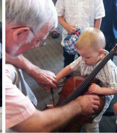
Family Concert Instrument Petting Zoo