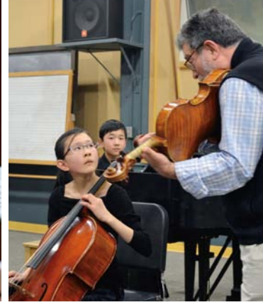
2013 Master Class with violist Toby Appel