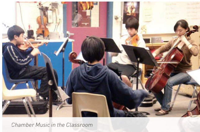
Chamber Music in the Classroom

For more than 20 years, Seattle Chamber Music Society has provided opportunities for people of all ages and backgrounds to experience the joys of chamber music.