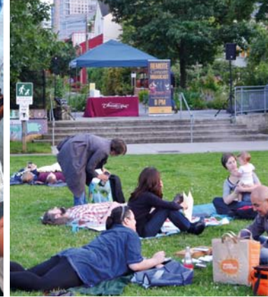
Music Under the Stars